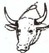
c) around the neck