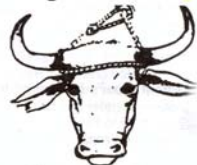
a) around both horns